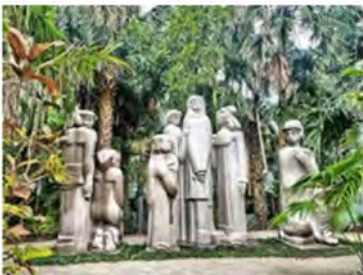
Ann Norton Sculpture Gardens Photography Exhibition ( click here )