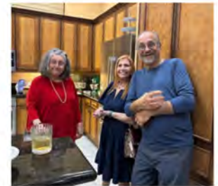
Books for our Adopt-A-Class at HHRC collected at the NPB annual Holiday party.